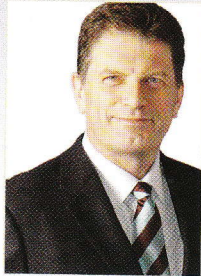
The Hon Ted Baillieu MP Premier of Victoria

It is my great pleasure to welcome you on behalf of the Victorian Government to the 2011 Australian International Airshow and Aerospace and Defence Exposition.