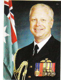
Air Marshal Mark Binskin AM Chief of Air Force

Welcome to Avalon 2011. Air Force is again proud to participate this year, and in the year of Air Force's 90th birthday it gives us special opportunity for Air Force to showcase our birthday theme tradition, innovation, evolution.